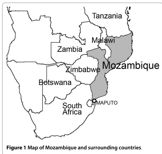
Figure 1 Map of Mozambique and surrounding countries.

tion given cotrimoxazole prophylaxis and medicine to manage opportunistic infections. ART became available nationwide in 2004 with the support of international funding agencies. Despite these efforts, < 25% of those with advanced HIV disease were receiving treatment in 2007. An estimated 1.5 million people were living with HIV in Mozambique in 2007, including 810,000 women and 100,000 children [1]. Annual deaths from AIDS-related causes are estimated to have increased from approximately 45,000 people in 2000 to 97,000 in 2005 [4].