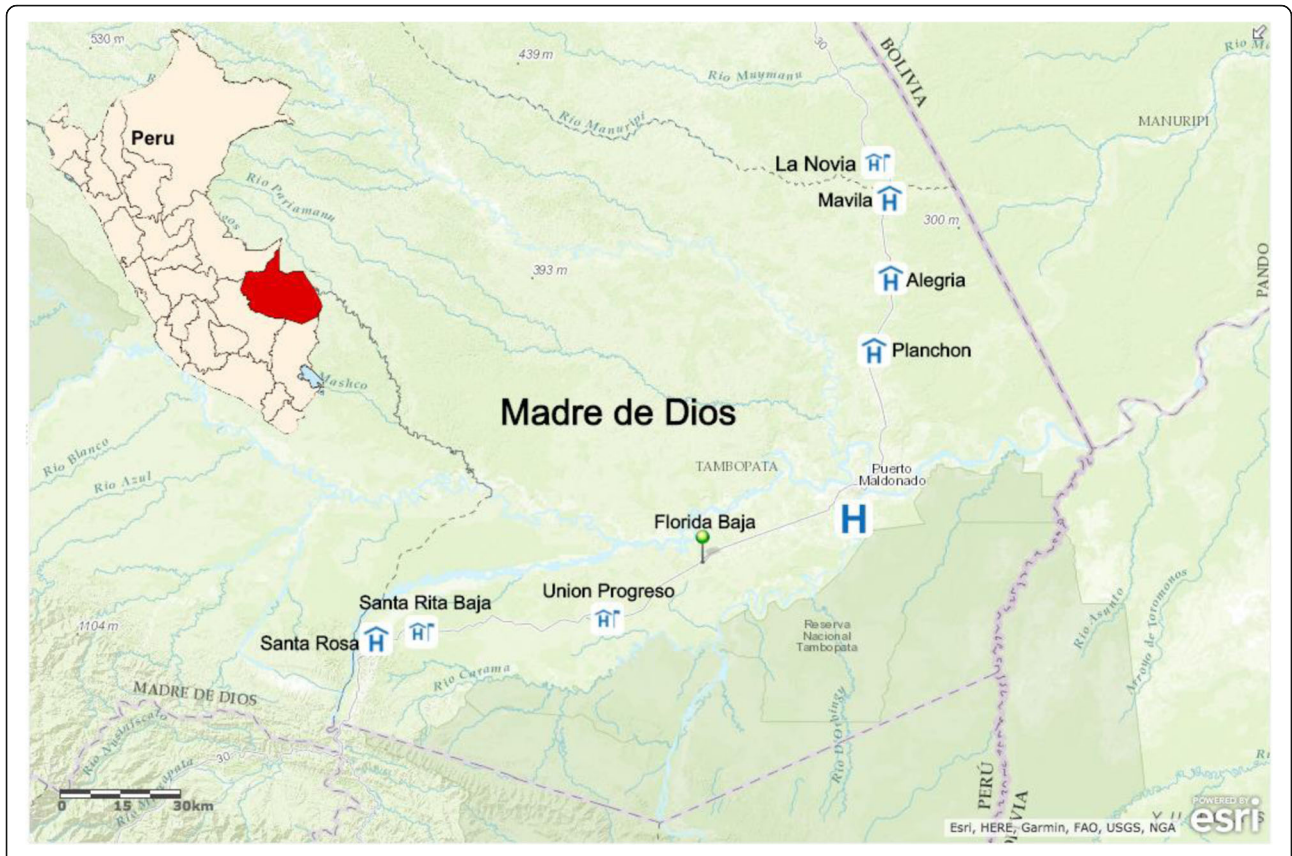
Fig. 2 Map of Madre de Dios and the surrounding eight communities involved in the study. Created Using: ArcGIS Online [Internet]. Redlands, CA: Environmental Systems Research Institute (ESRI); Available from: www.esri.com