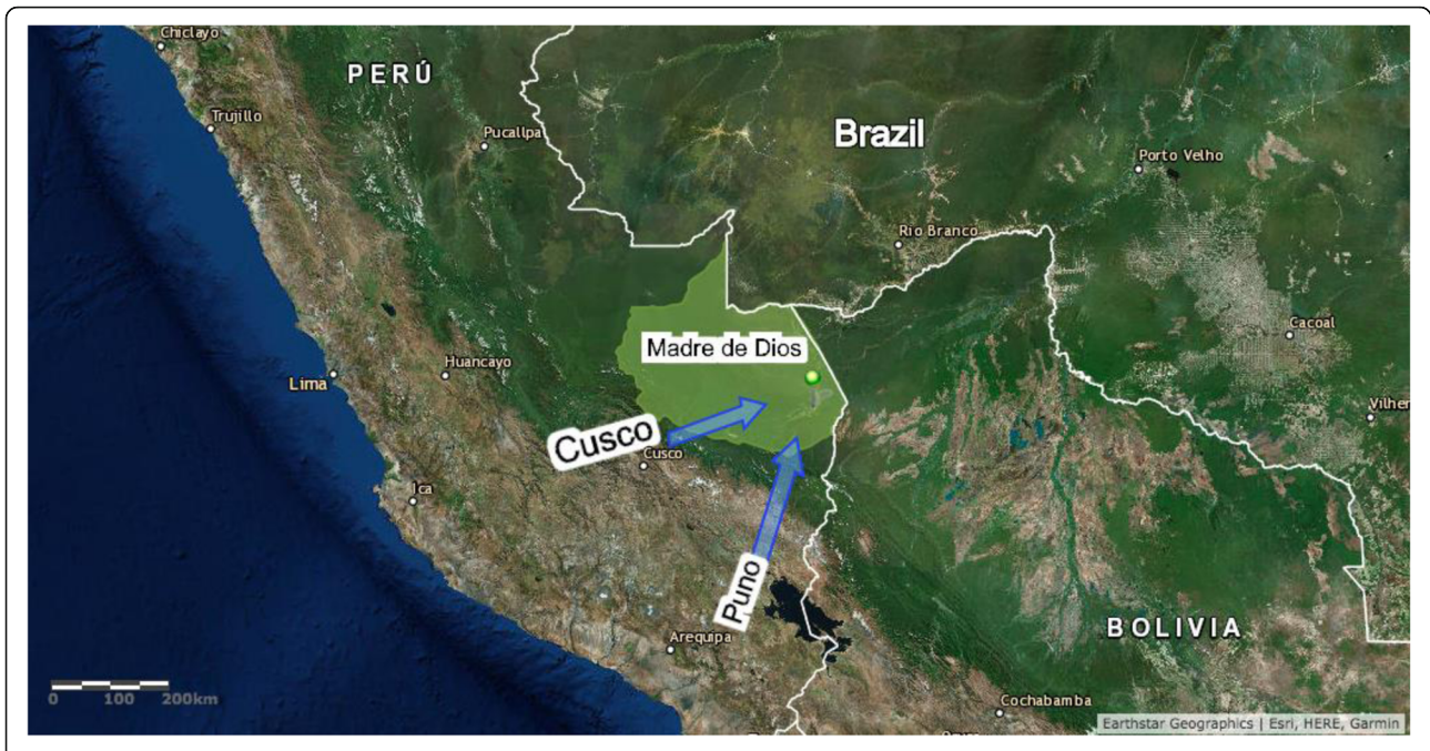
Fig. 1 Map illustrating the major migration patterns to Madre de Dios following the construction of the Interoceanic Highway. Created Using: ArcGIS Online [Internet]. Redlands, CA: Environmental Systems Research Institute (ESRI); Available from: www.esri.com