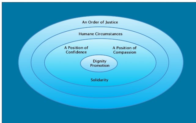
Figure 3 Portrayal of dignity promotion.

of violation tend to cluster. Grouping, labeling, vilification, and discrimination often co-occur, for example, forming social order-level phenomena known as racism, when directed at individuals or groups of color, or stigma, when directed at individuals or groups whose identities have been "spoiled" by a discrediting difference [39,40].